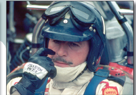
Graham Hill at Silverstone, March 1969.