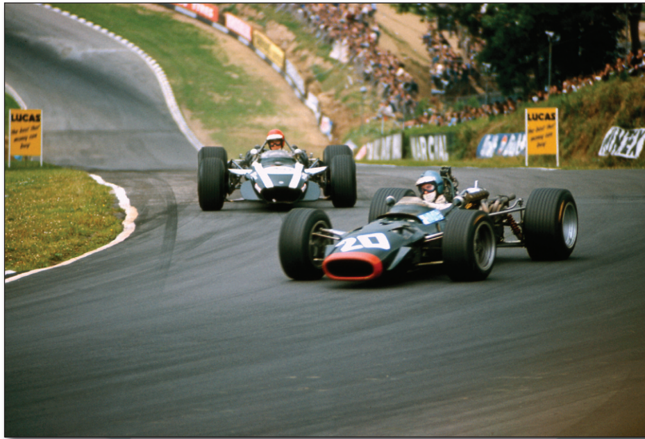
Piers Courage at Brands Hatch with Reg Parnell's BRM in the 1968 British Grand Prix.