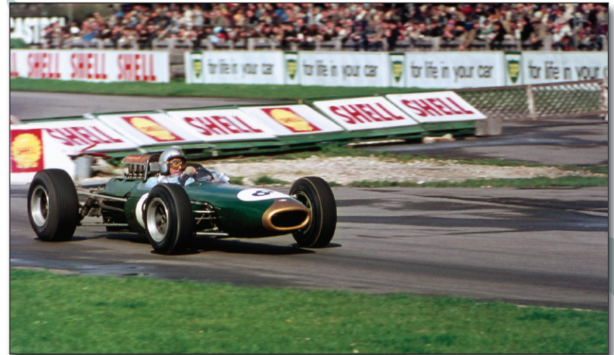
Jack Brabham in his characteristic cockpit style exits the chicane on a drying track.

Right: Keeping the driver and cockpit dry is the priority of the day.