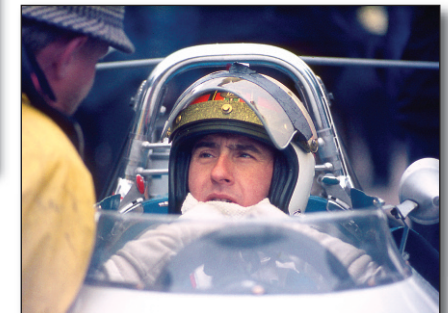
Right: Jackie Stewart in discussion with an official during the wet Saturday morning practice session in the Silverstone pits.